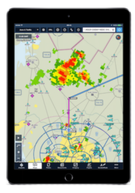
Illustration : ForeFlight, SkyDemon, and EasyVFR displaying ADS-B traffic and weather from SkyEcho 2 is shown below.

Traffic and flight information should begin streaming to the application when in range.